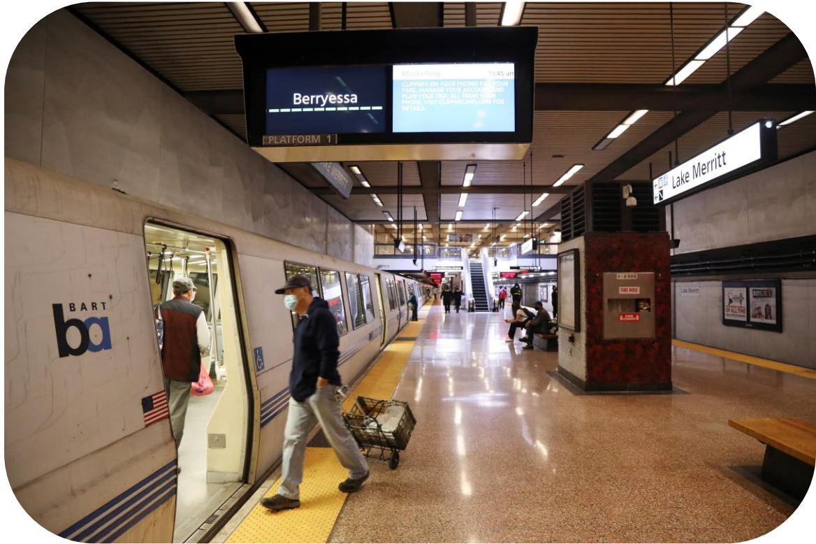
Pilot at Lake Merritt – May 2021