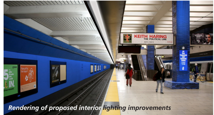
Rendering of proposed interior lighting improvements