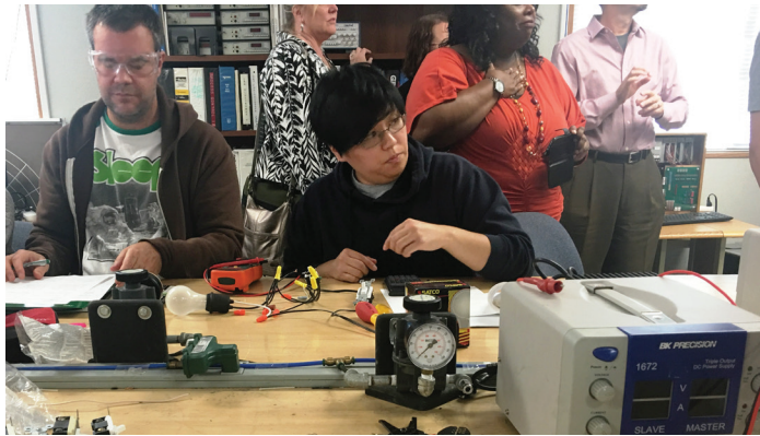
TCLT Program students at Los Medanos College in Pittsburg learn about circuit currents.

Technical training is now underway at participating community colleges and will run through December 2017. Participants will increase their knowledge and skills so they can be competitive for BART job classifications such as Electricians, Train Control Electronic Technicians, and Transit Vehicle Electronic Technicians.