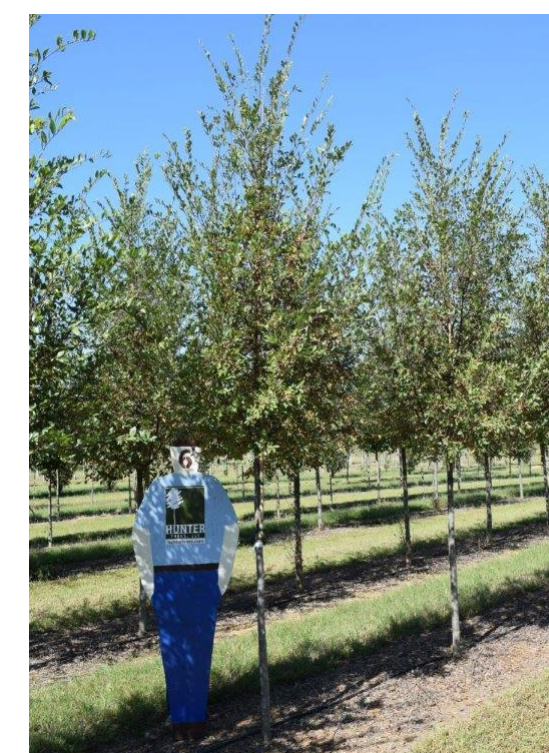
Chinese Elm 24" box