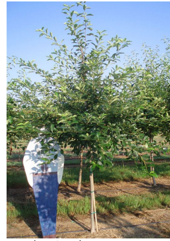
Tupelo - 24" box