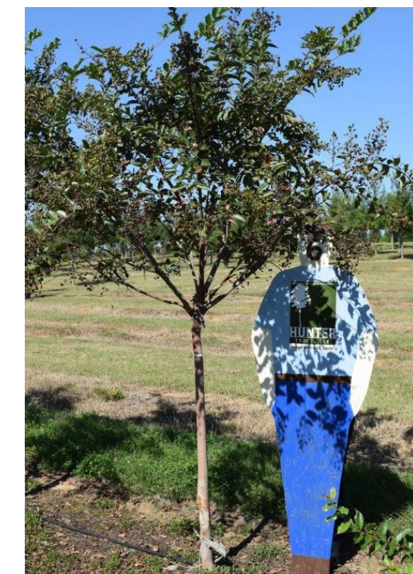
Crape Myrtle 24" box